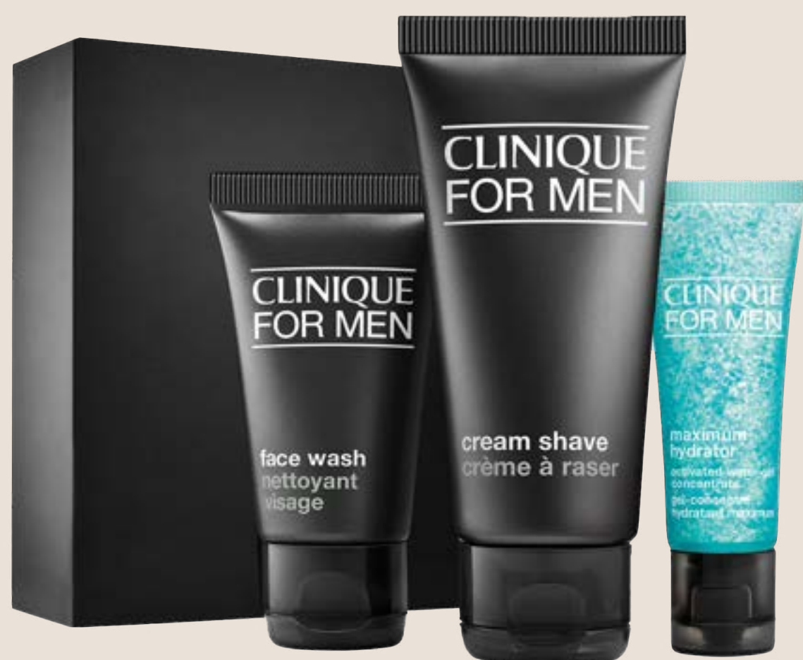
CLINIQUE FOR MEN TRIO

Striking bowls with slender stems and a graceful silhouette from Italian designer, Luigi Bormioli.