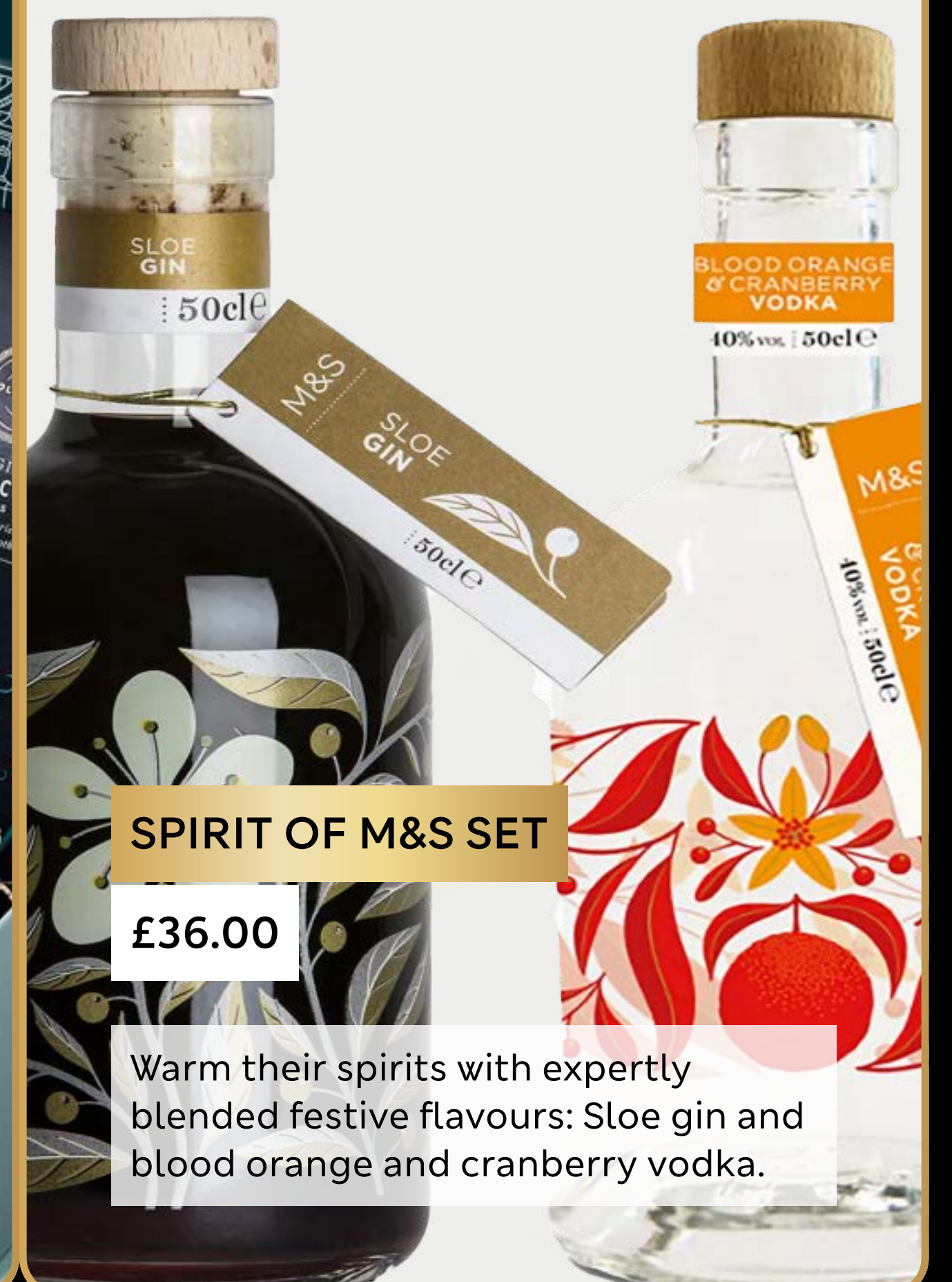
SPIRIT OF M&S SET

A fitting reward for any explorer: luxury Belgian hot chocolate with all the tempting trimmings.