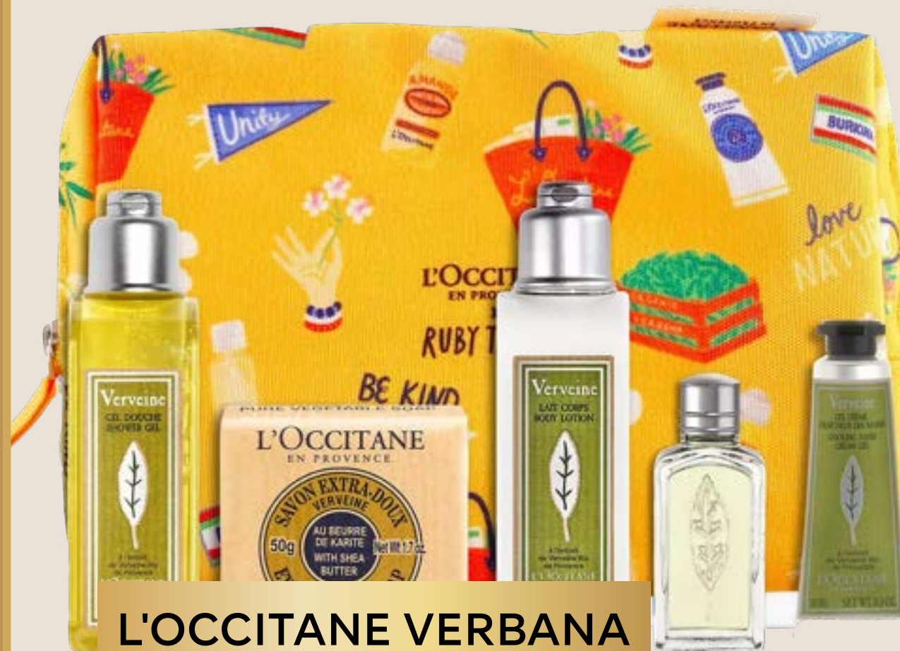
L'OCCITANE VERBANA COLLECTION

A travel-friendly trio of customised formulas designed for intense hydration every day.