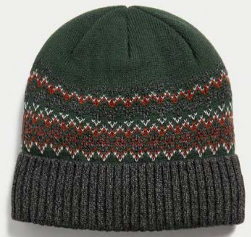
FAIR ISLE HAT & SCARF SET

Series 2 design with a grippy rubber base and handy carry loop for additional practicality.