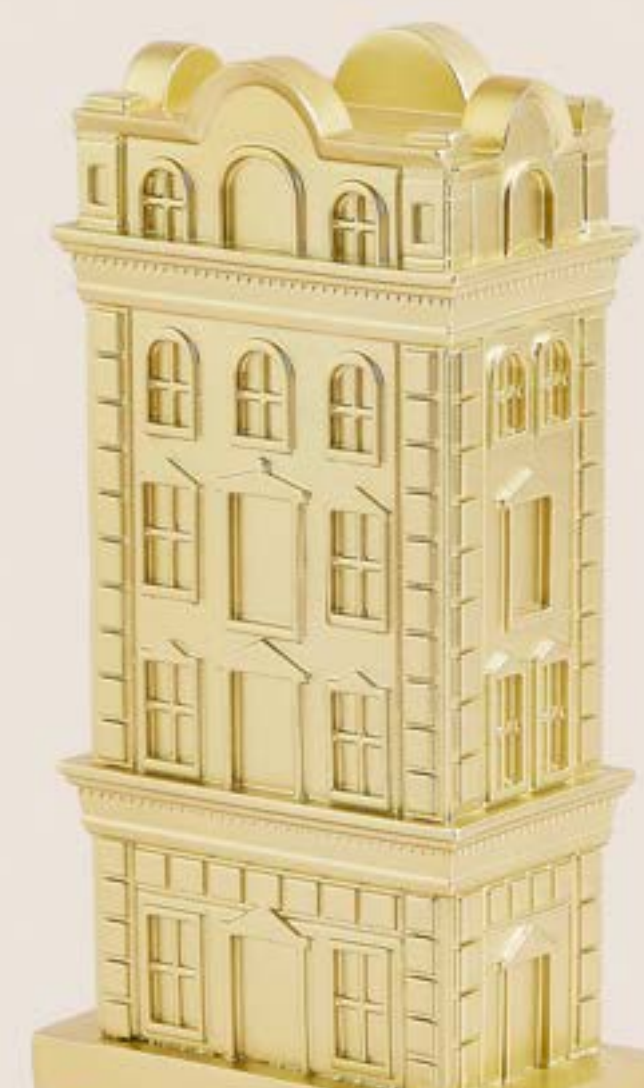
GOLD STOCKING HOLDER

The perfect personalised gift, with plush fabric and gold detailing for that extra-special finish.