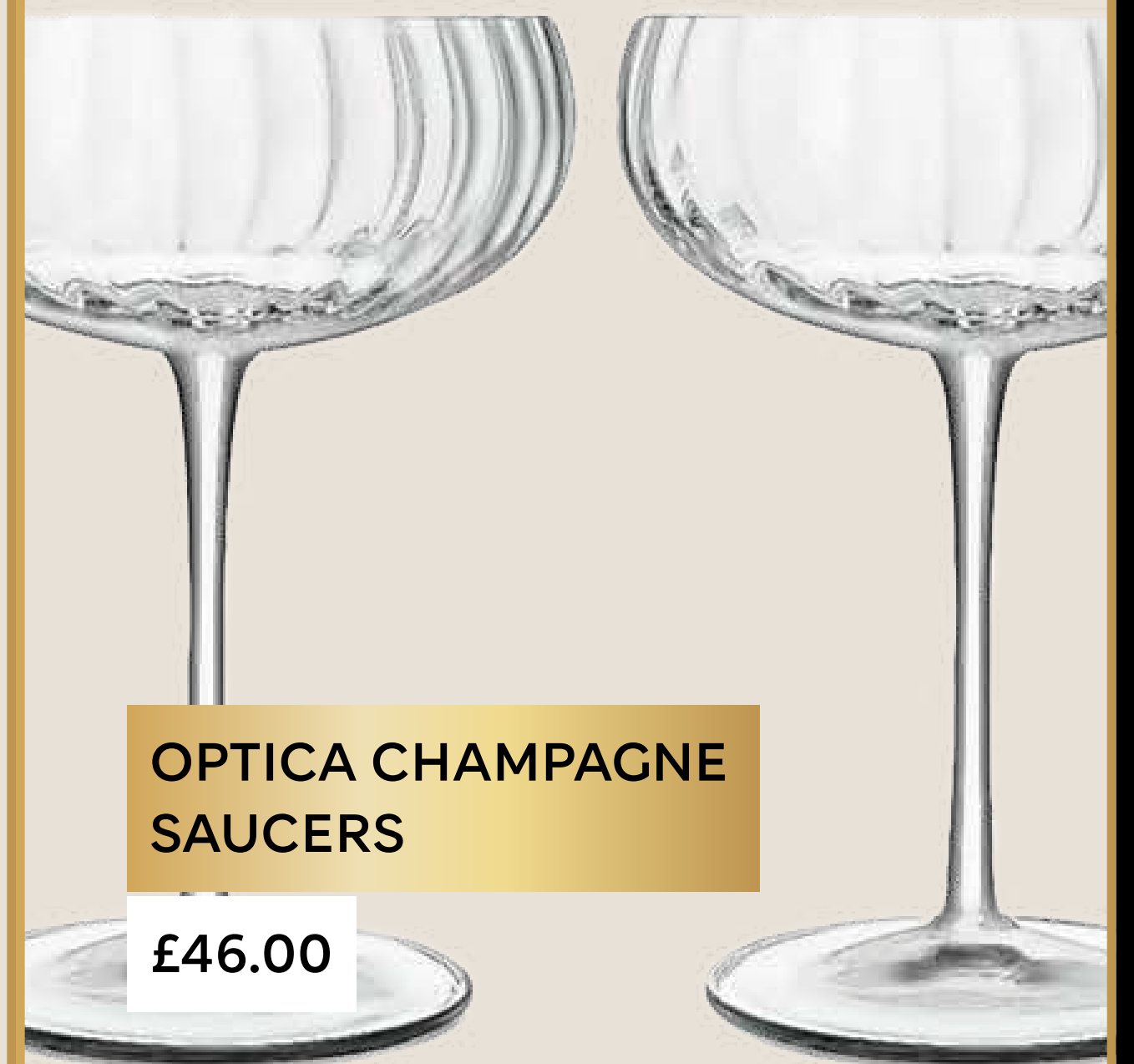
OPTICA CHAMPAGNE SAUCERS

Featuring trailing floral design, these pure cotton pieces feel luxuriously soft and wonderfully weighty.