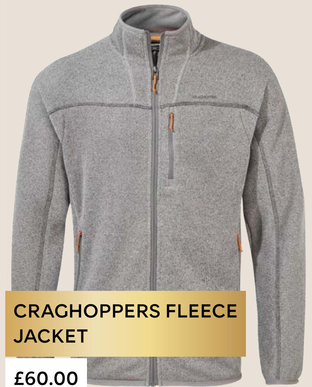
CRAGHOPPERS FLEECE JACKET

Technical backpack with ergonomic straps, scuff-resistant fabric and Stormwear™ finish.