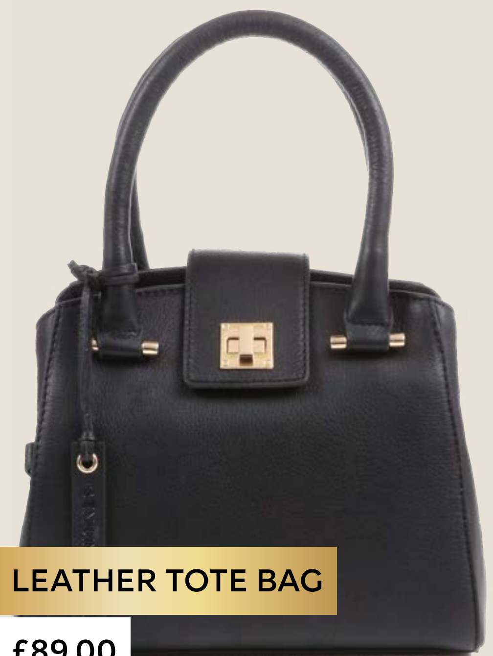
LEATHER TOTE BAG

Five classically crisp products featuring organic verbena harvested by hand in Provence.