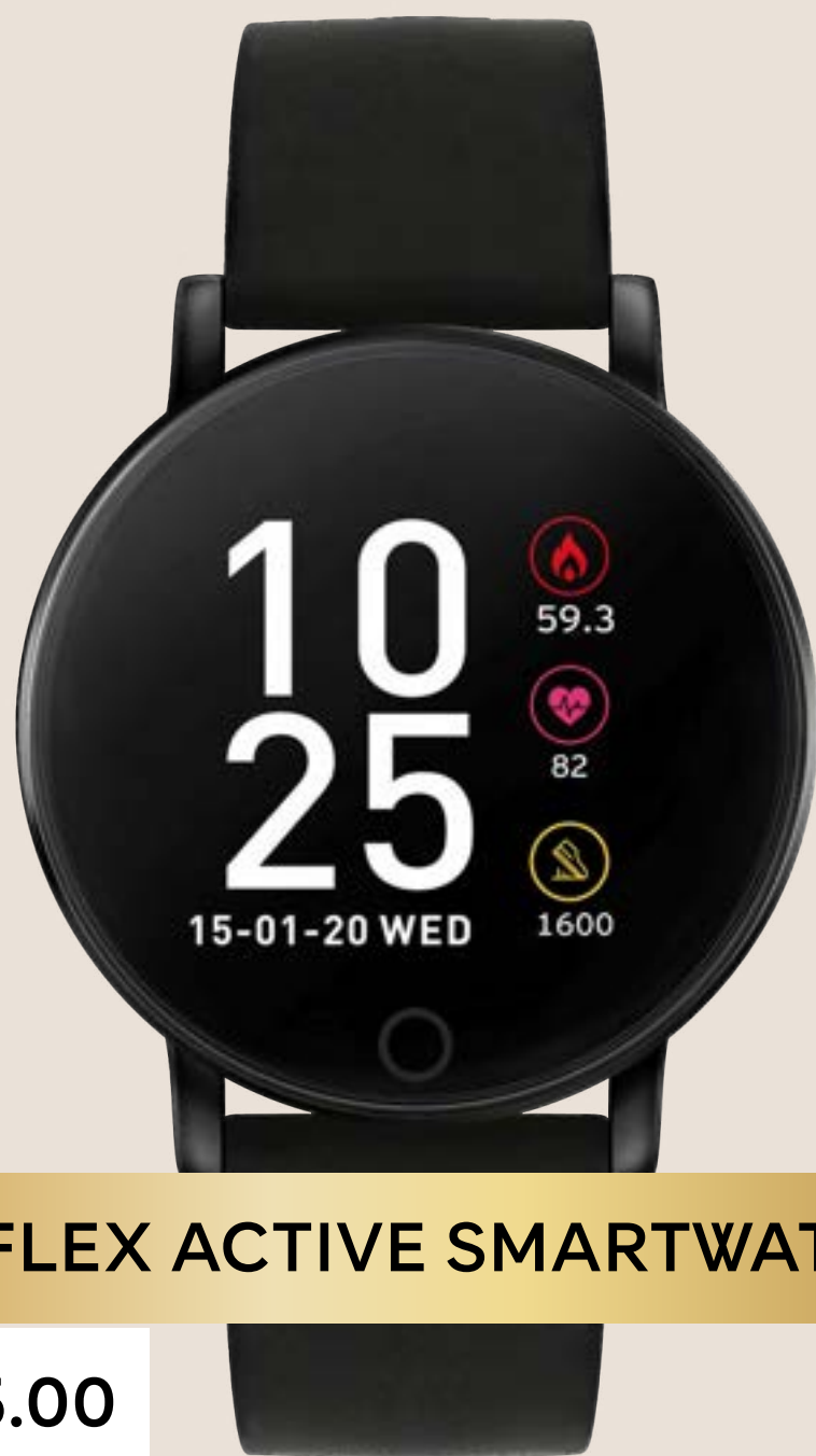
REFLEX ACTIVE SMARTWATCH

Made for wrapping up on chilly adventures, this classic two-piece set features the distinctive Fair Isle design.