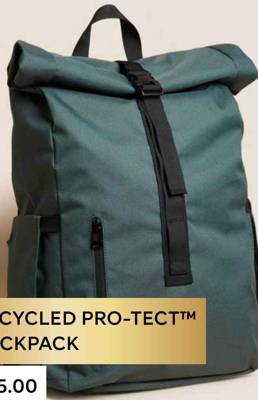
RECYCLED PRO-TECT™ BACKPACK

The ideal hiking companion with real-time weather updates, activity tracker and calorie counter.