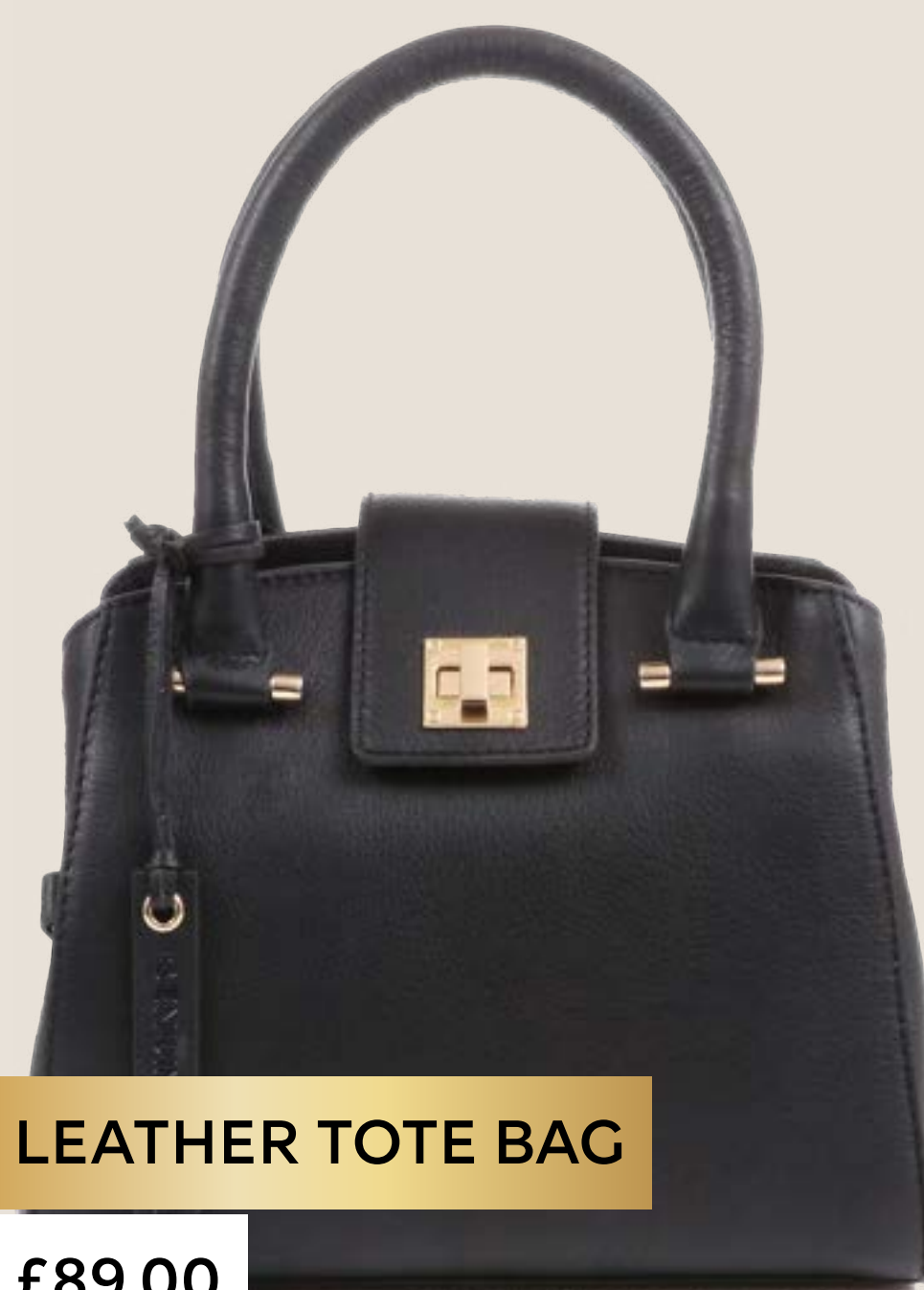
LEATHER TOTE BAG

Five classically crisp products featuring organic verbena harvested by hand in Provence.