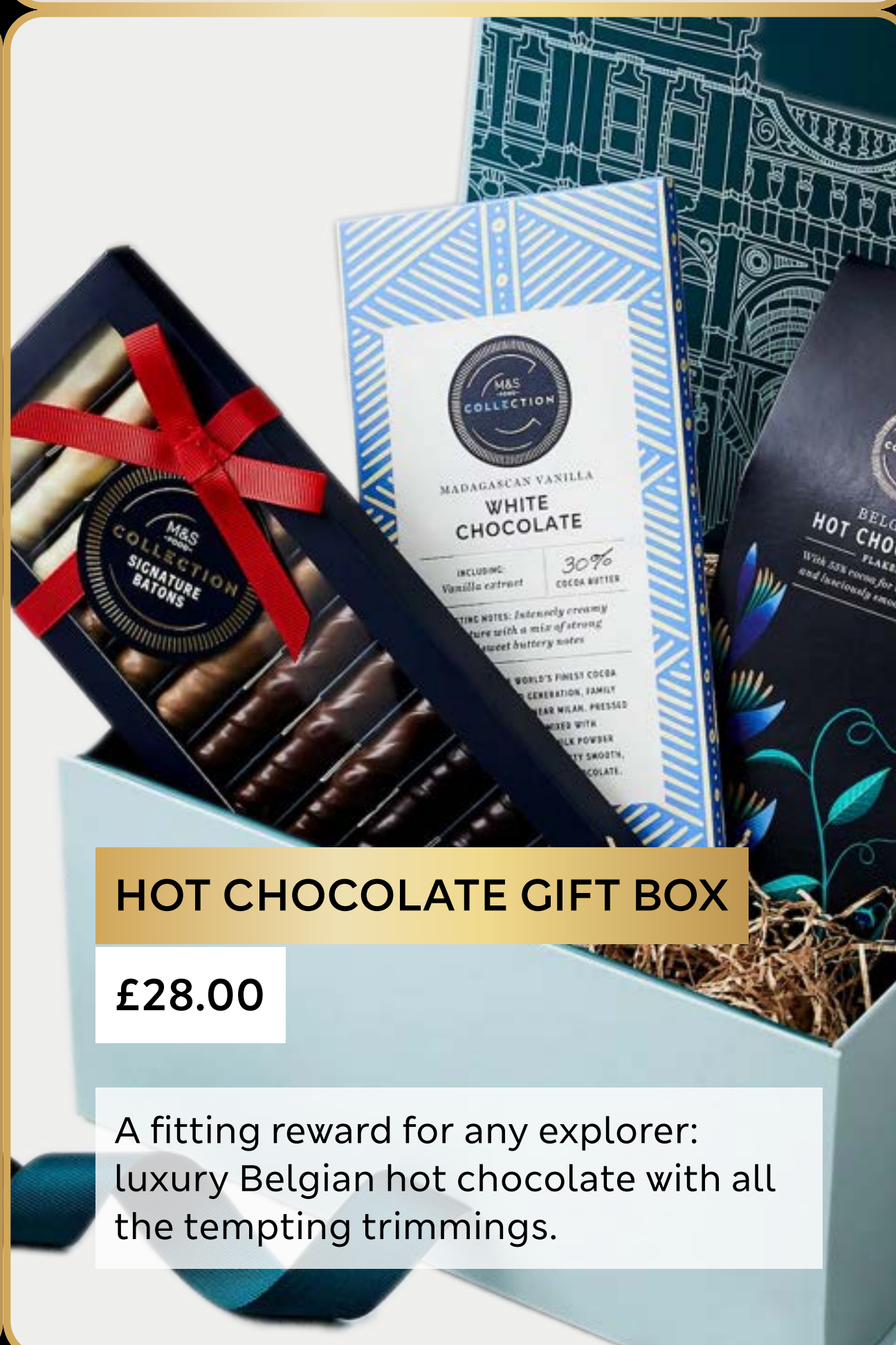
HOT CHOCOLATE GIFT BOX

Two-pack of durable socks with targeted cushioning and arch support for ultimate trekking comfort.