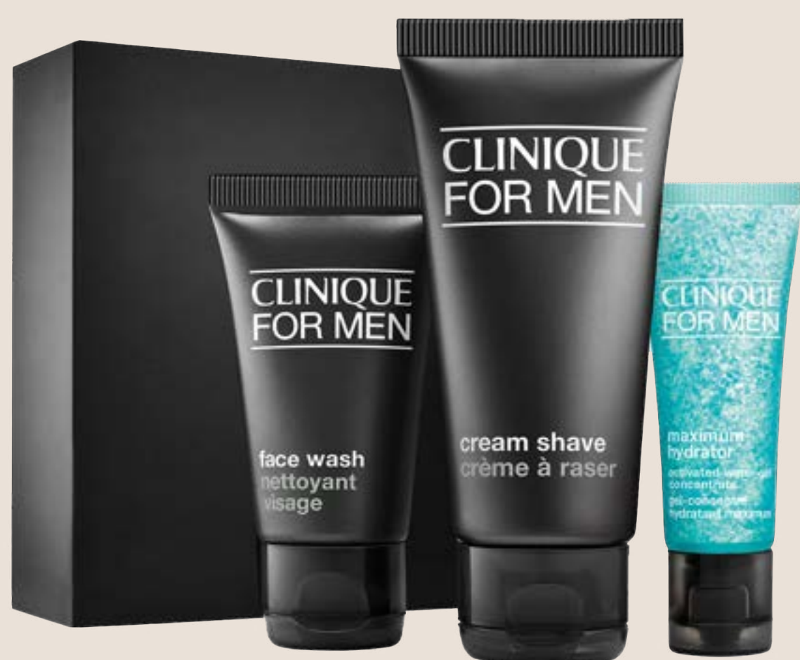
CLINIQUE FOR MEN TRIO

Striking bowls with slender stems and a graceful silhouette from Italian designer, Luigi Bormioli.