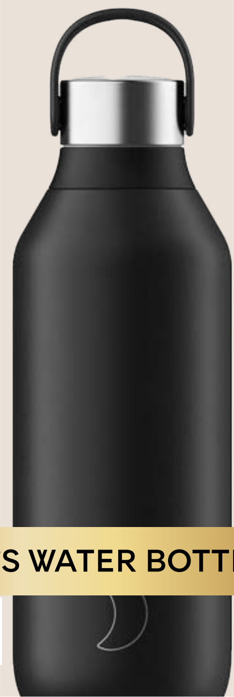
CHILLY'S WATER BOTTLE