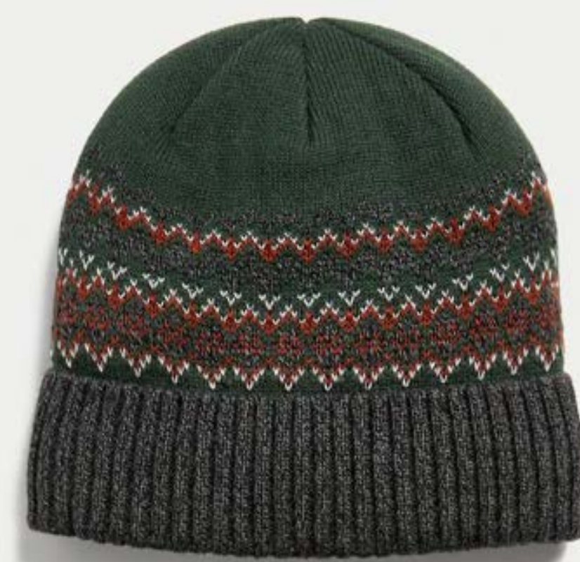
FAIR ISLE HAT & SCARF SET

Series 2 design with a grippy rubber base and handy carry loop for additional practicality.