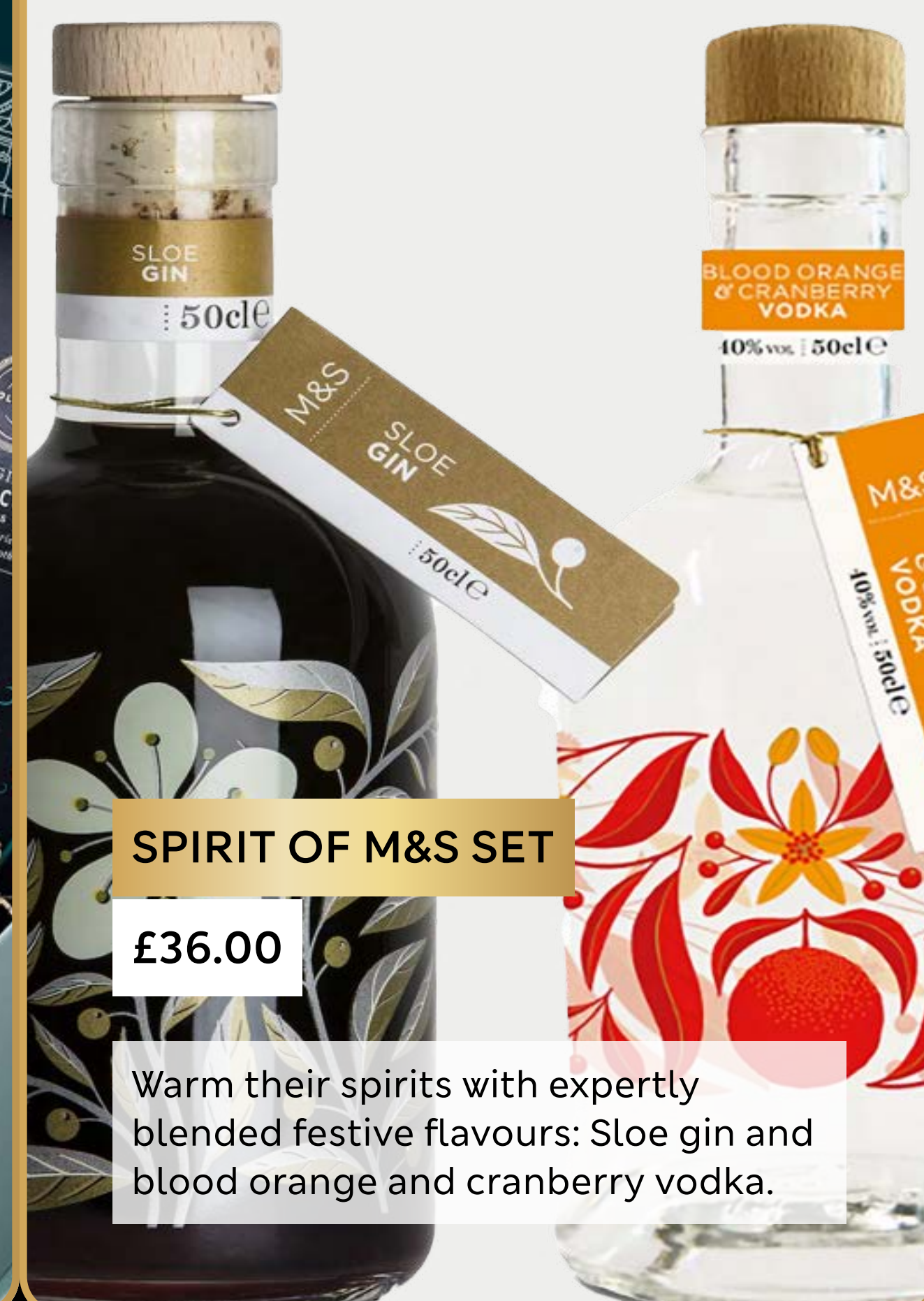
SPIRIT OF M&S SET

A fitting reward for any explorer: luxury Belgian hot chocolate with all the tempting trimmings.