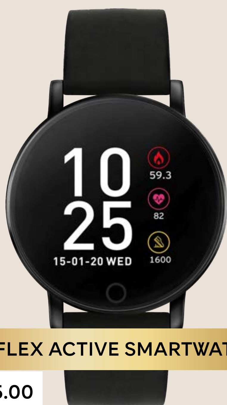
REFLEX ACTIVE SMARTWATCH

Made for wrapping up on chilly adventures, this classic two-piece set features the distinctive Fair Isle design.