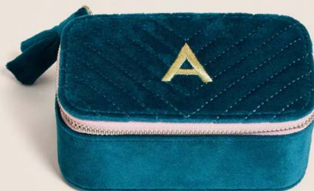
ALPHABET VELVET JEWELLERY BOX

A gold-tone rim and handle add a luxurious finishing touch to this fine china leopard mug from Spode's collection.