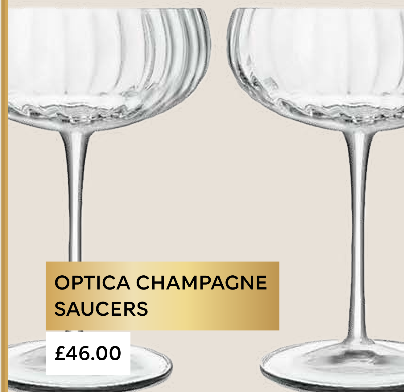
OPTICA CHAMPAGNE SAUCERS

Featuring trailing floral design, these pure cotton pieces feel luxuriously soft and wonderfully weighty.