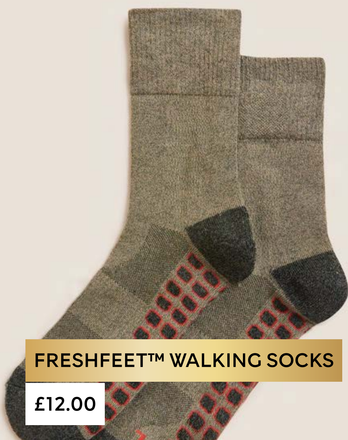
FRESHFEET™ WALKING SOCKS

Zip-up, funnel-neck, long-sleeve fleece with colour-pop pulls to add a crisp finish.