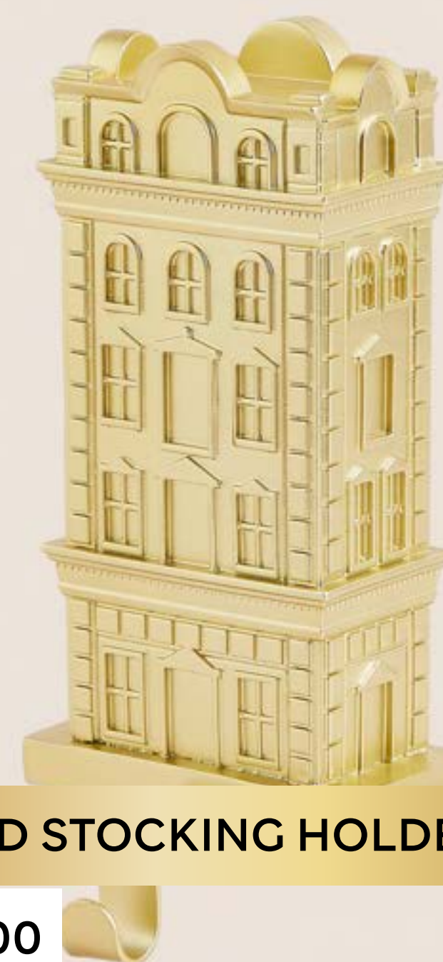
GOLD STOCKING HOLDER

The perfect personalised gift, with plush fabric and gold detailing for that extra-special finish.