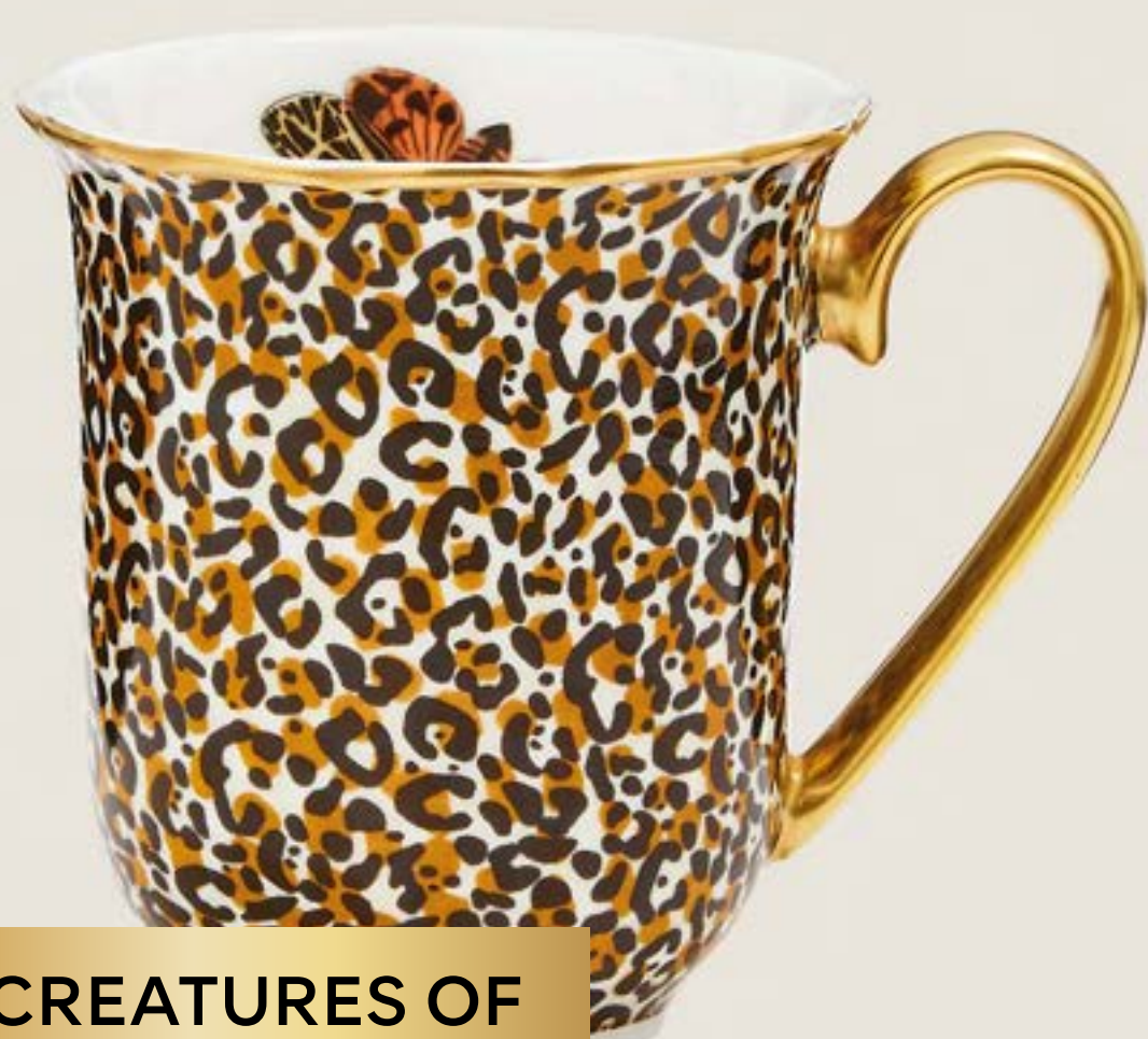
CREATURES OF CURIOSITY MUG

Soft grained leather, handy cross-body strap and glossy metal trims from Jones Bootmaker.