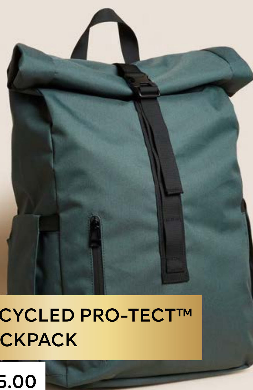
RECYCLED PRO-TECT™ BACKPACK

The ideal hiking companion with real-time weather updates, activity tracker and calorie counter.