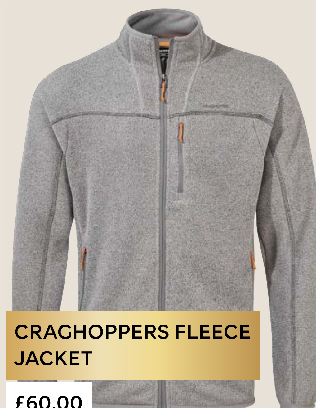
CRAGHOPPERS FLEECE JACKET

Technical backpack with ergonomic straps, scuff-resistant fabric and Stormwear™ finish.