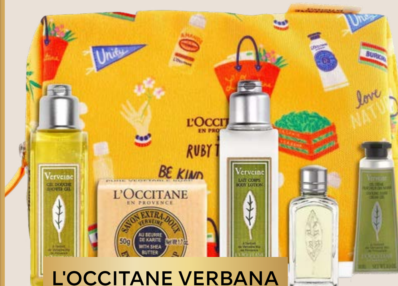
L'OCCITANE VERBANA COLLECTION

A travel-friendly trio of customised formulas designed for intense hydration every day.