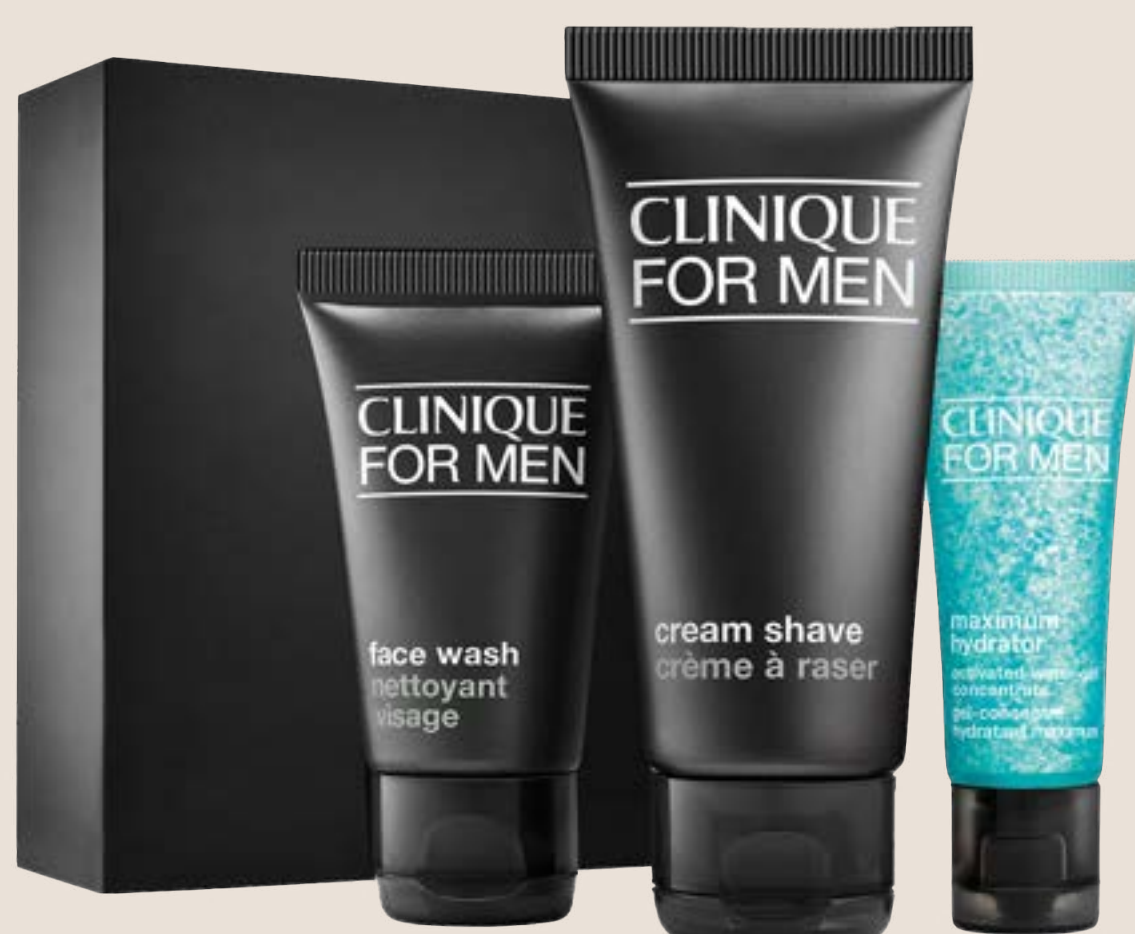
CLINIQUE FOR MEN TRIO