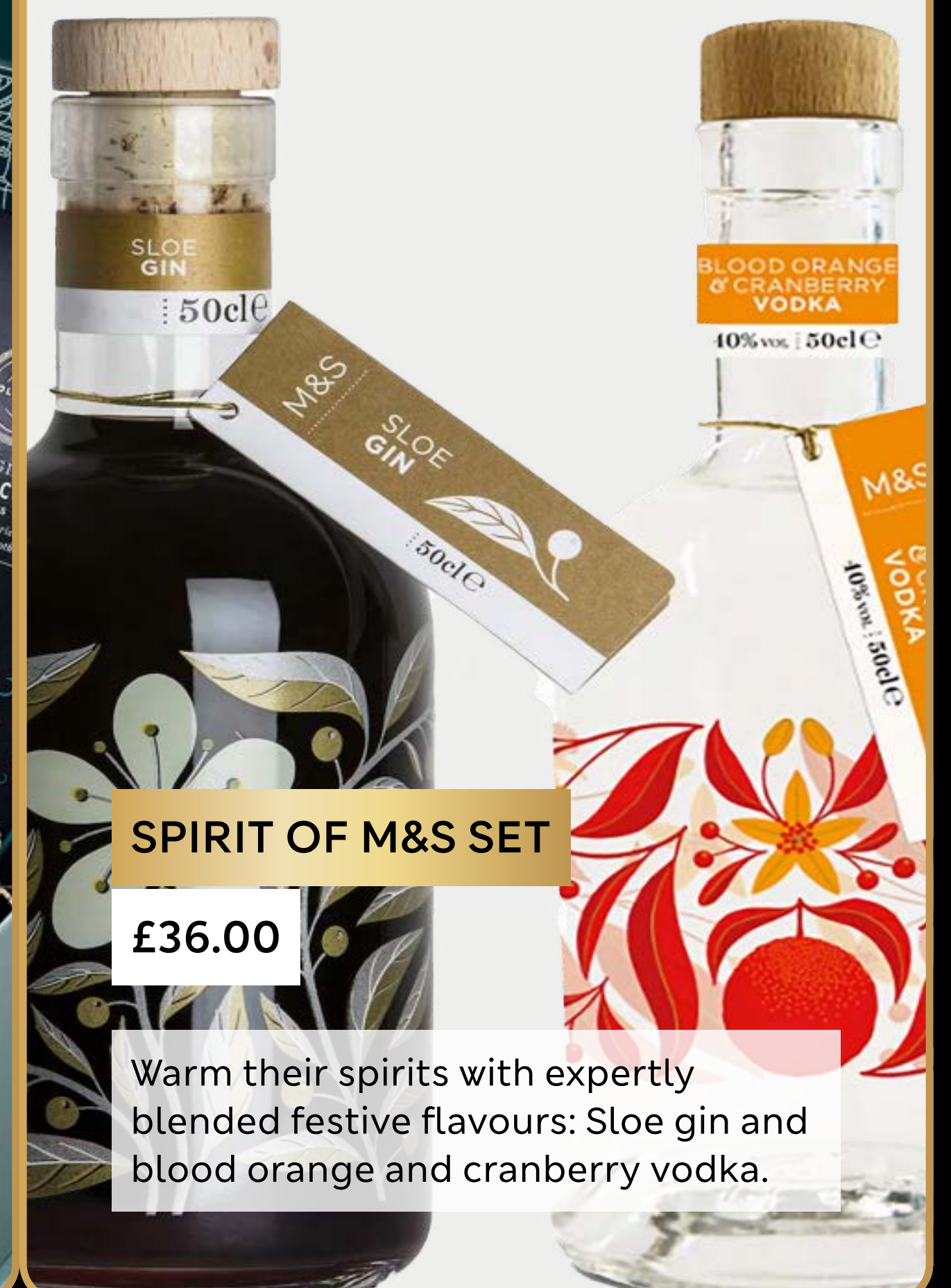
SPIRIT OF M&S SET

A fitting reward for any explorer: luxury Belgian hot chocolate with all the tempting trimmings.