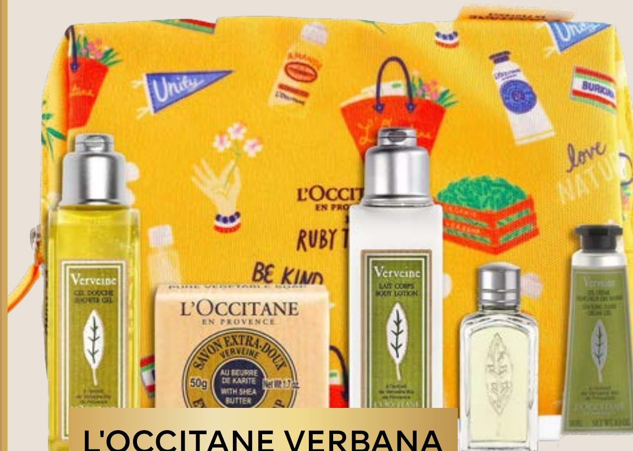
L'OCCITANE VERBANA COLLECTION

A travel-friendly trio of customised formulas designed for intense hydration every day.